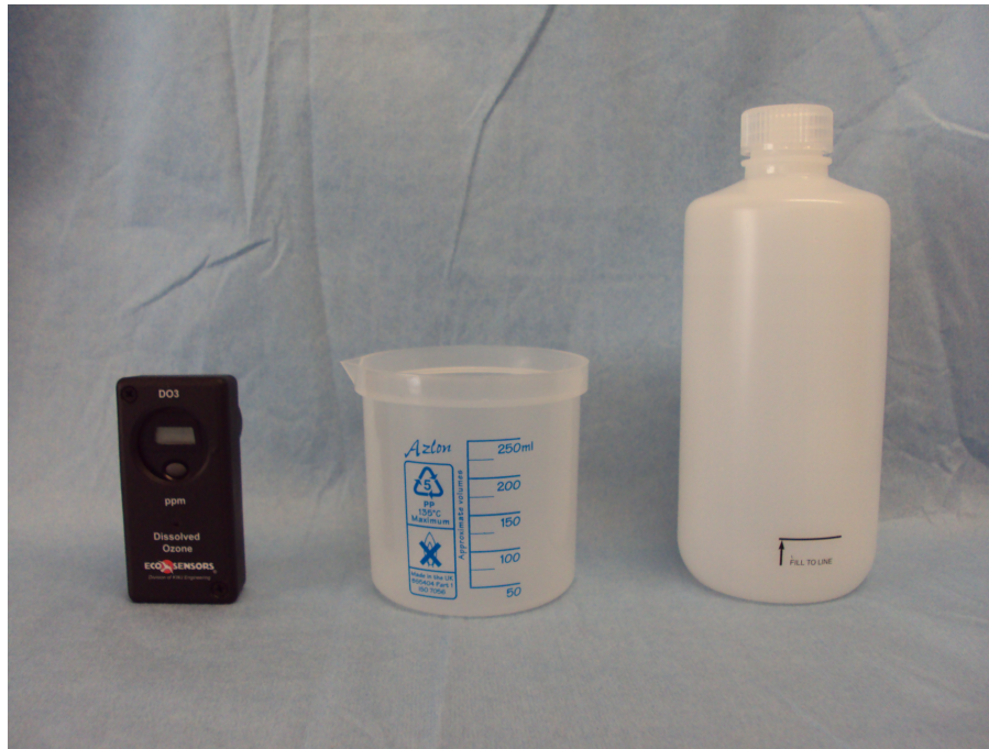
Figure 2: DO3 with 250 ml Beaker and Sample Bottle (provided)