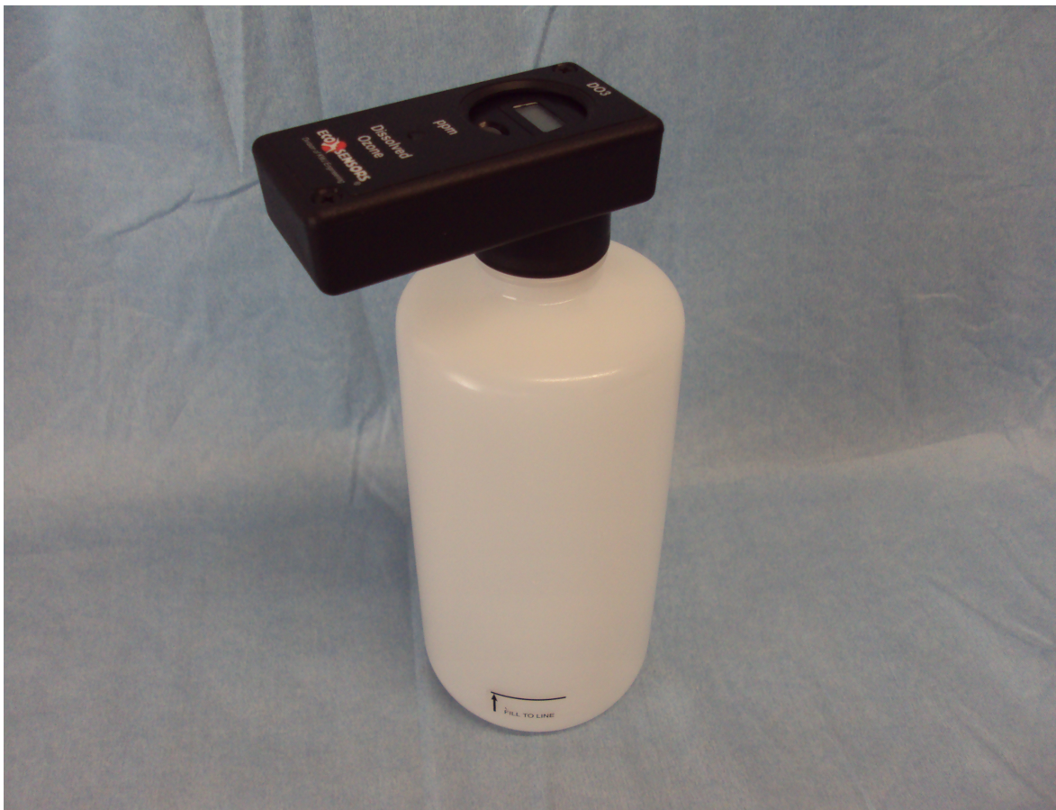
Figure 4: DO3 on sample bottle for measurement.

NOTE: For better accuracy in water of low Dissolved Ozone, or high ozone demand, it is recommended that you repeat the measurement several times.