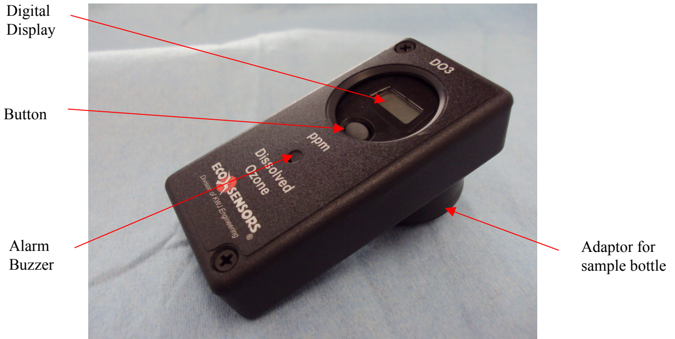
Figure 1: DO3 by Eco Sensors