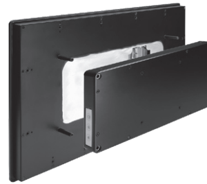
▲ Modulized design