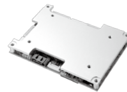
◀ Side view with heatsink