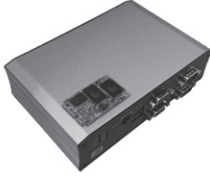
Slim and compact size 163.8 x 108 x 44 mm