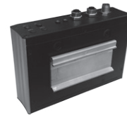
DIN-rail, wall mount supported for various applications, without space limitation