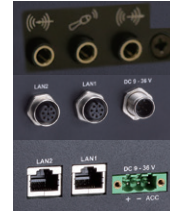
Optional I/O ports for audio, LAN jack type and DC-in jack type