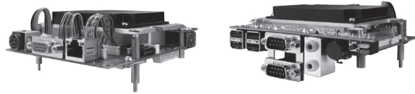
▲ Assembly view